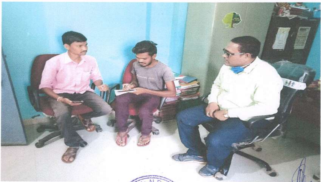
Student along with concern teacher taking interview of villegers